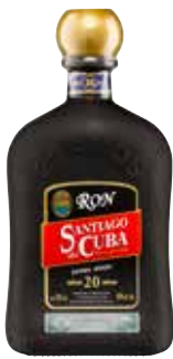
Extra Añejo 20 Años Page 43