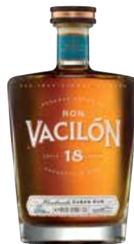
Reserva Especial 18 Años Page 22