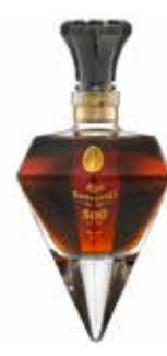
Santiago de Cuba 500 Page 46