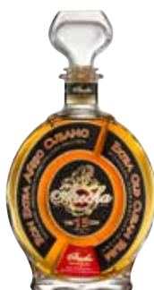
Extra Añejo 15 Años Page 36