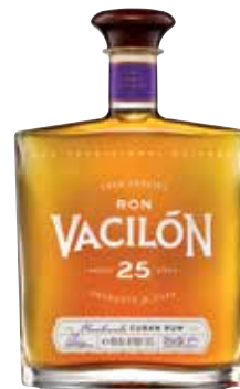
Gran Paraiso 25 Años Page 23