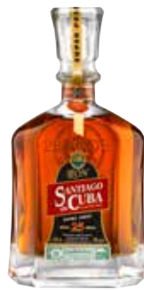
Extra Añejo 25 Años Page 43