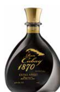
Extra Añejo 1870 Page 28