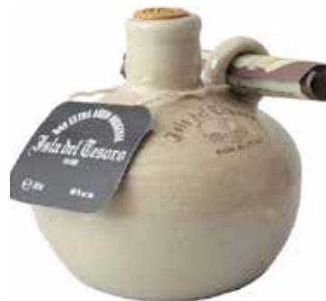
Isla del Tesoro Page 49