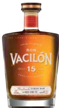
Gran Reserva 15 Años Page 22