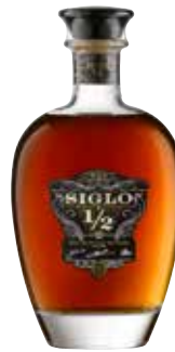
Siglo y 1/2 Page 44